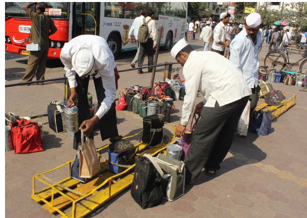
Dabbawalas photograph is courtesy of and copyrighted by Firoze Shakir.

Every core process needs to support the mission in a simple, visible, and consistent